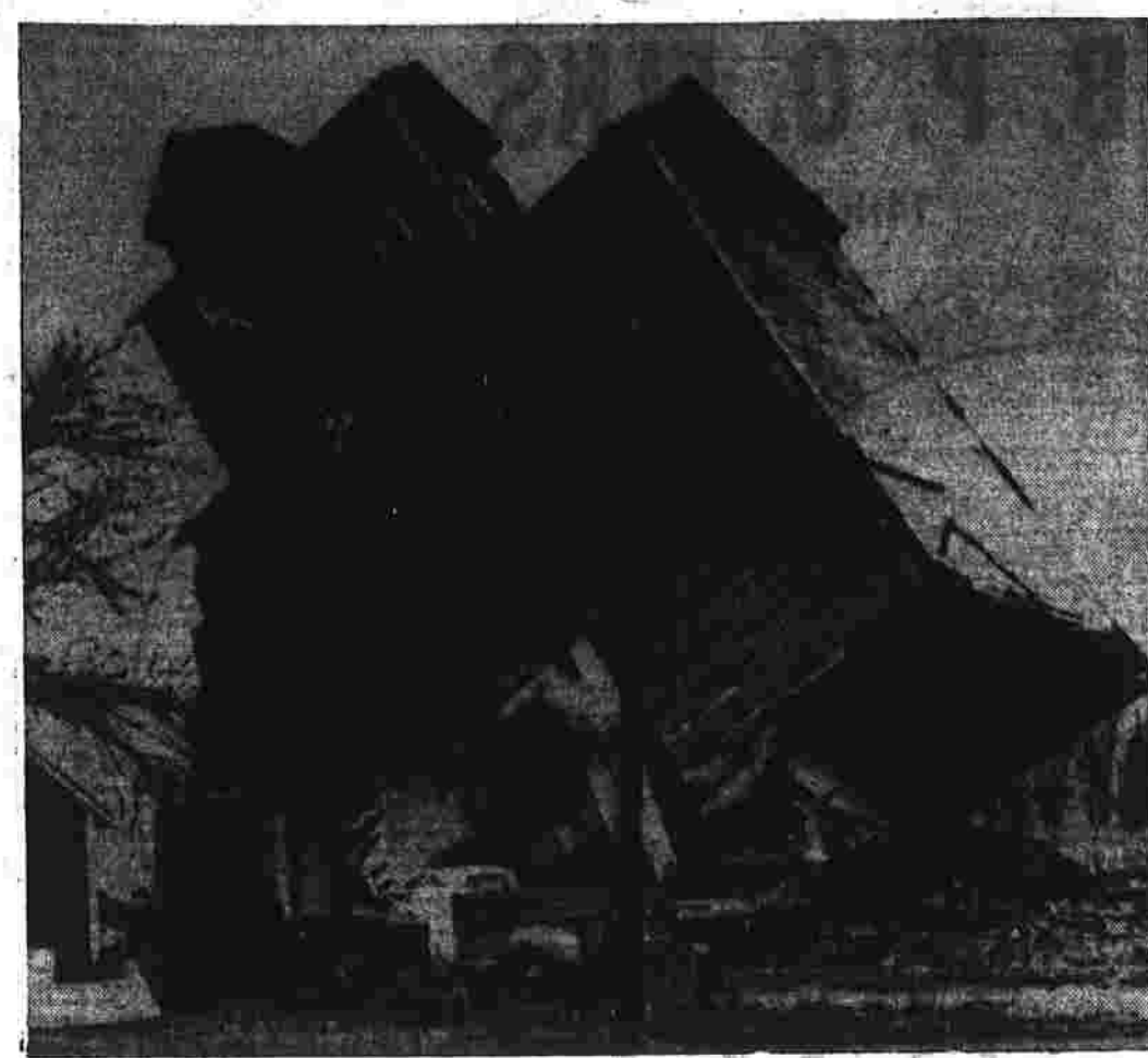
Where, Oh Where, Did the Bulldozer Go?

SAN ANTONIO, TEX. (AP)—Air Force trainees at Lackland Air Force Base here are in semi-isolation and authorities at three Army bases have taken similar measures to combat outbreaks of epidemic meningitis, which has killed two recruits this week.