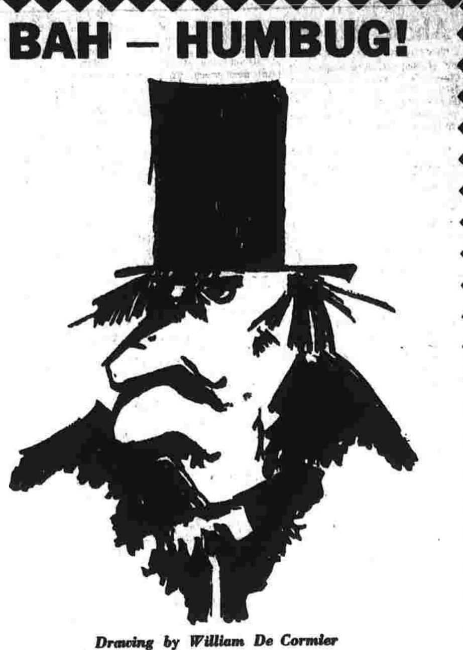
Dracing by William De Cormier