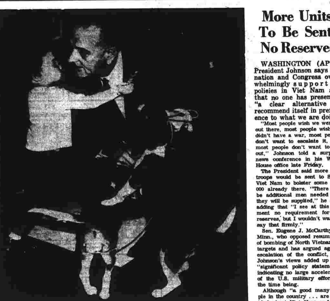
President Johnson took time out from world problems yesterday to greet his daughter, Luci Bunker Johnson, two-year-old daughter of President Johnson and Jacqueline Kennedy. Together they took a walk in the White House corridors.